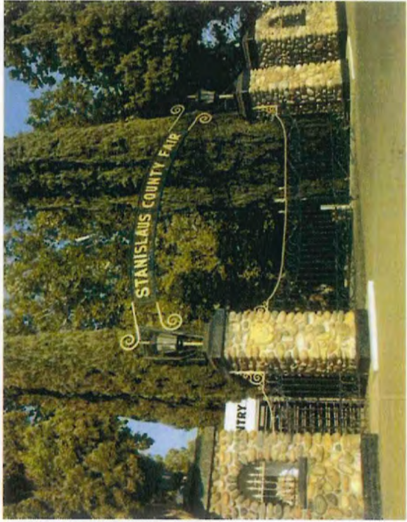
Stanislaus County Fairgrounds